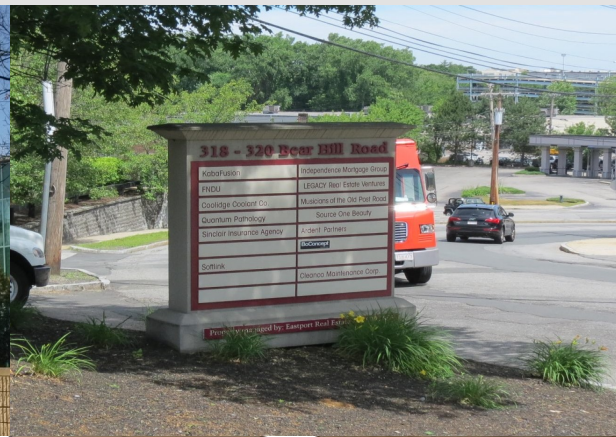
318 BEAR HILL ROAD, WALTHAM